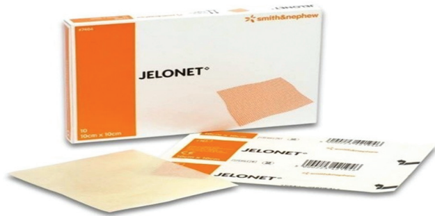
Figure 3. Jelonet dressing. ( http://homecaresupplies.ca/products/wound-care/dressings/jelonet-dressing.html )