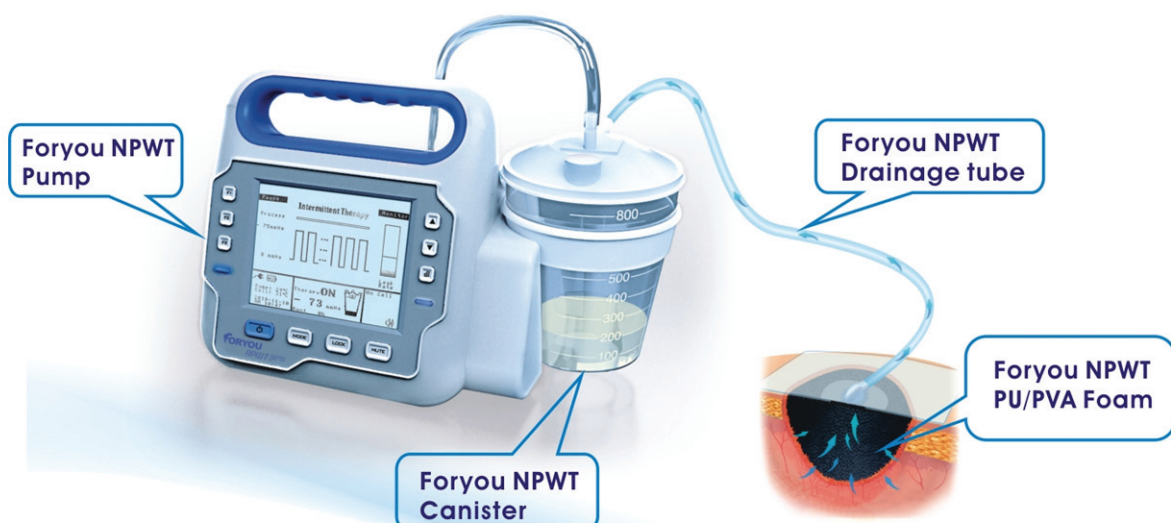
Figure 2. Diagram showing the set up for NPWT and dressing. ( http://www.foryounpwt.com/services/whatnpwt.html )

Interestingly, wound contraction seems to be observed at relatively low levels of pressure -40 to -80 mmHg and additional negative pressure does not increase wound contraction further. The advantage of greater wound contraction may lead to massive stimulation of granulation tissue and thus faster healing. However, this movement of the wound edges may cause damage to underlying organs causing rupture and bleeding. A report from Lund University, Sweden, indicates that there is less damage to the heart when using gauze than foam. 8 It is also recommends modifying technique by reducing the suction from -125 mm Hg to -70 mm Hg after 72 hours of treatment. In addition, routine placement of paraffin gauze over the surface of the RV before applying the suction dressing may help reduce adhesions and minimize trauma between dressing changes. 9